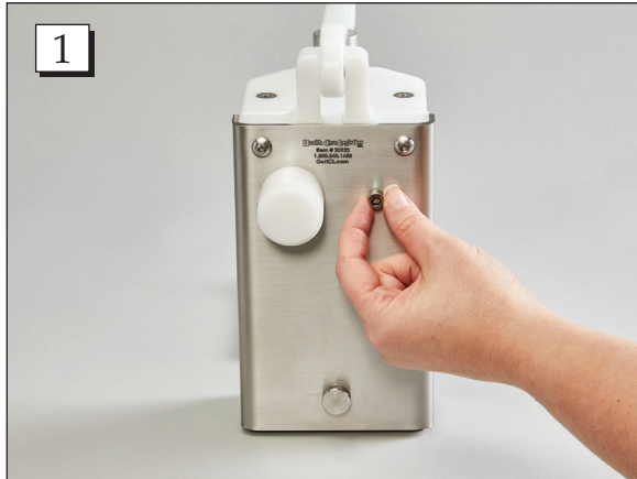
Step 1. Remove the ¼" socket head cap screw from the back of the unit.