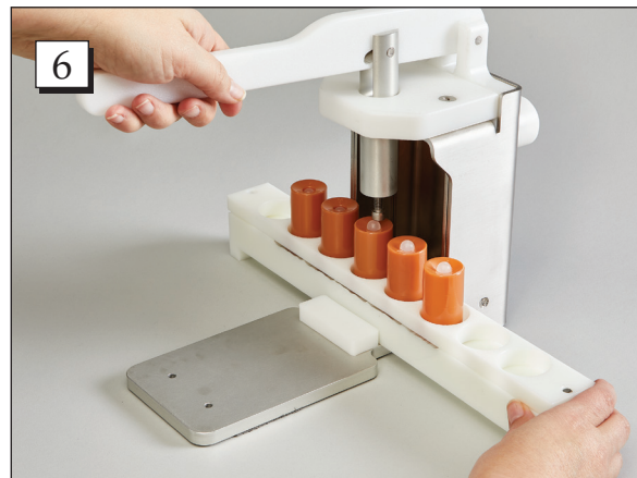
Step 6. Place the Easy Fill ball over the sealing hole in the vial and gently press the ball into place.