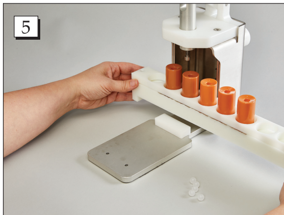
Step 5. Fill the vial with medication. Then place the carrier in between the guide block and the frame.