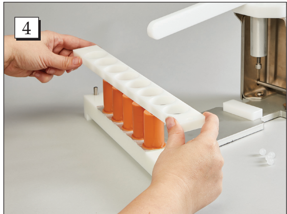
Step 4. Place the top of the carrier over the Easy Fill Vials and onto the locating pins.