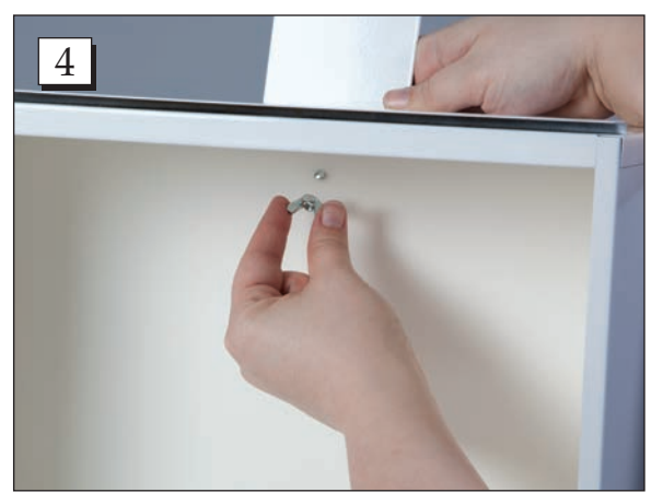
Step 4. Now fasten the bolt in place from the inside of the box with a wing nut. Repeat step 3 and 4 on the bottom hole.