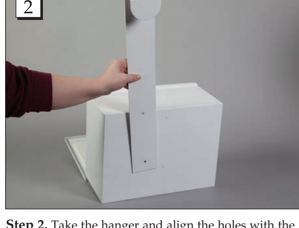
Step 2. Take the hanger and align the holes with the holes in the back of the box. Make sure the hook on the hanger is facing outward.