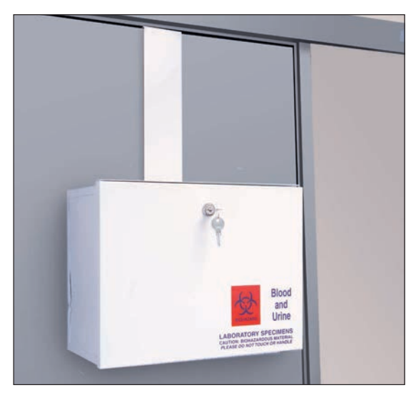
Your Over the Door Lock Box is now ready to be used.

Call Free: 1.800.848.1633 • Fax Free: 1.800.447.2923 Web: GoHCL.com • Email: hcl@GoHCL.com