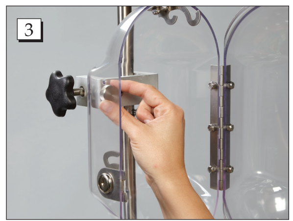
Step 3. Tighten the locking wheel on the inside of the pod.