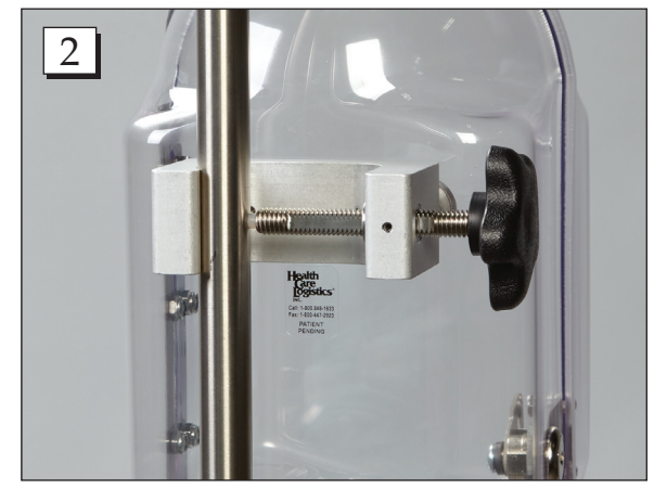
Step 2. Mount the pod to the IV pole and tighten the mounting knob.