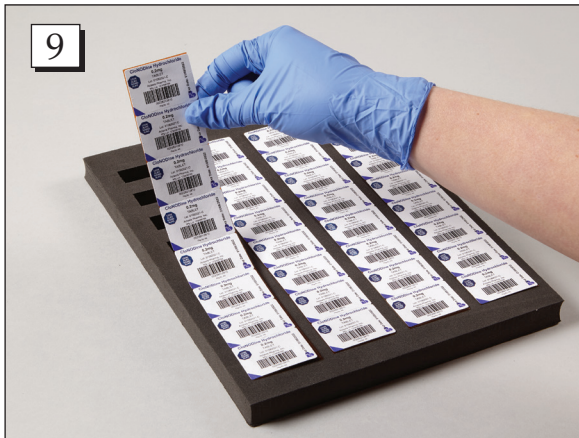
Step 9. Remove the strips from the sealing tray.