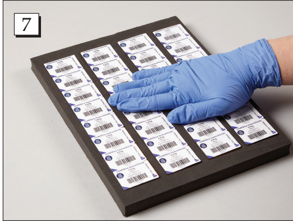
Step 7. Gently press the labels onto the blisters.