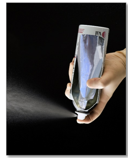
11 oz. Aerosol "Inverta Spray" DECWFI-SP-70-B