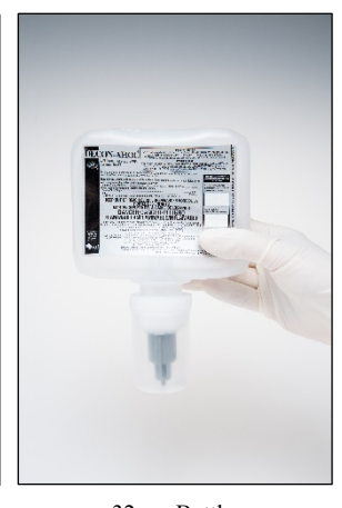
32 oz. Bottle DECWFI-BOT-02