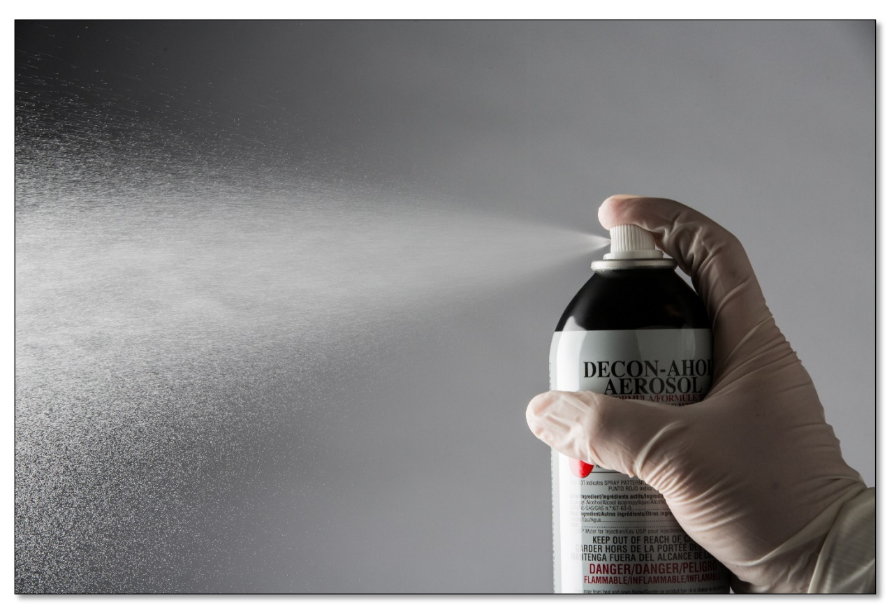
DECWFI-SP-70 Spray/Mist Aerosol

Container Disposal: Non-refillable container. Do not reuse this container. Offer for recycling where available or puncture and dispose of in a sanitary landfill, or by procedures approved by state and local authorities.