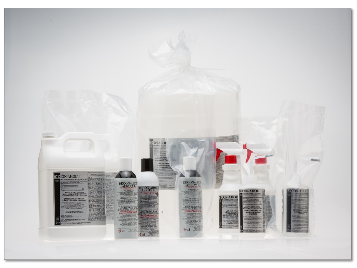
DECON-AHOL WFI Formula Family of Products

(Any specific product label is available upon request.)