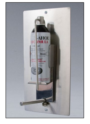
DEC-50 with DECWFI-SP-70