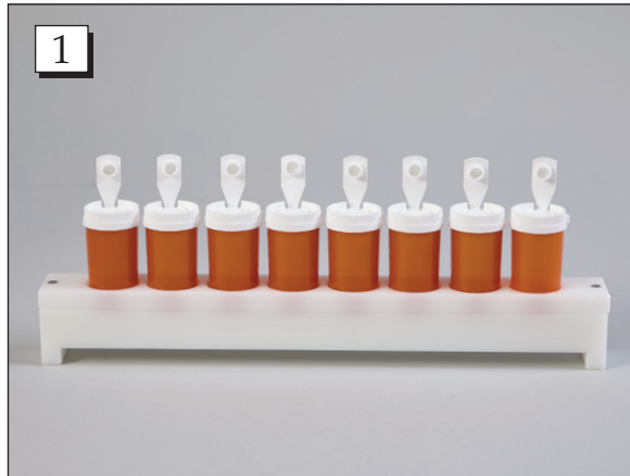
Step 1. Place the vials into the holder openings.