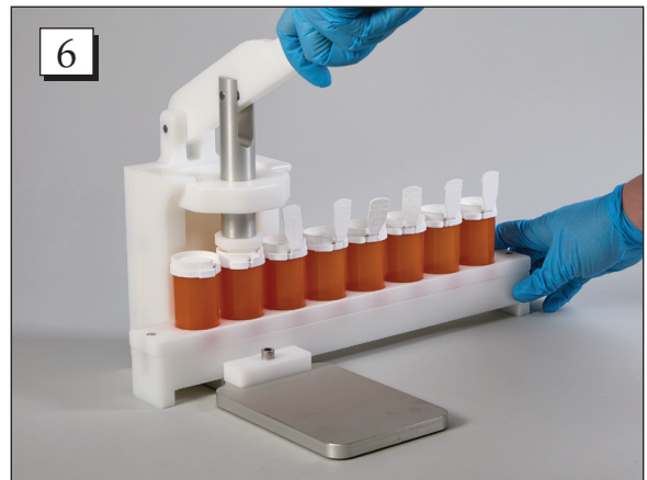
Step 6. Slide the holder forward to the next vial.

HCL® Tamper Tuf™ Vials w/ Caps sold separately HCL® Tamper Tuf™ Vials w/ Caps, 15mL #7748-Unassembled, #7741-Assembled HCL® Tamper Tuf™ Vials w/ Caps, 30mL #7749-Unassembled, #7743-Assembled