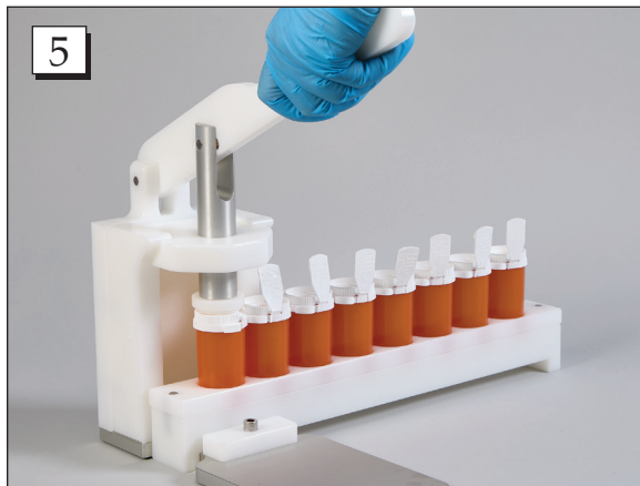
Step 5. Position the tab under the press and push down until you hear the tab snap closed.