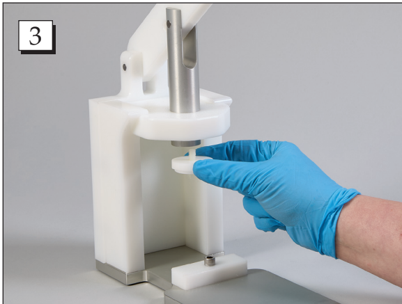
Step 3. Remove the adapter from the side of the unit and install it into the press.