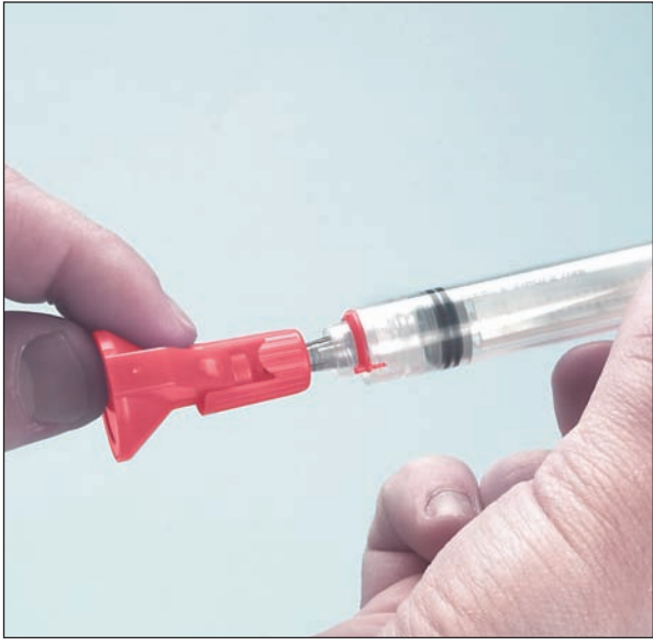
1. Push the top portion of the needle guard out until it locks with the needle luer.