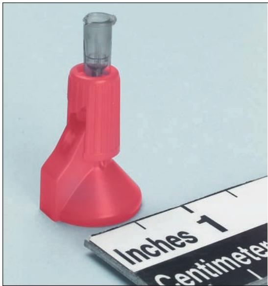
3. The needle guard and needle can be placed in a disposal bag or sharps container.